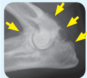
Arthritic elbow joint in a dog with lots of "fluffy" new bone (yellow arrows) around the joint, indicative of marked arthritis.