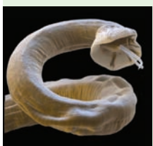
Electron micrograph of an adult lungworm

Lungworm are swallowed as tiny larvae, which migrate into the circulation of the liver and travel to the right side of the heart. Here they develop into adult worms (see photo left) which can build up in the heart. Here the adults mate and produce eggs. The eggs hatch into larvae and then migrate into the lung tissue. These larvae are coughed up and are passed out into your dog's faeces to re-infect molluscs.