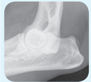
X-ray of a normal elbow joint

Radiography is commonly used to investigate joint problems.